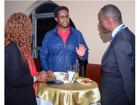
The evening culminated in a colorful cocktail session providing a networking opportunity among the delegates, sponsors, and the exhibitors.