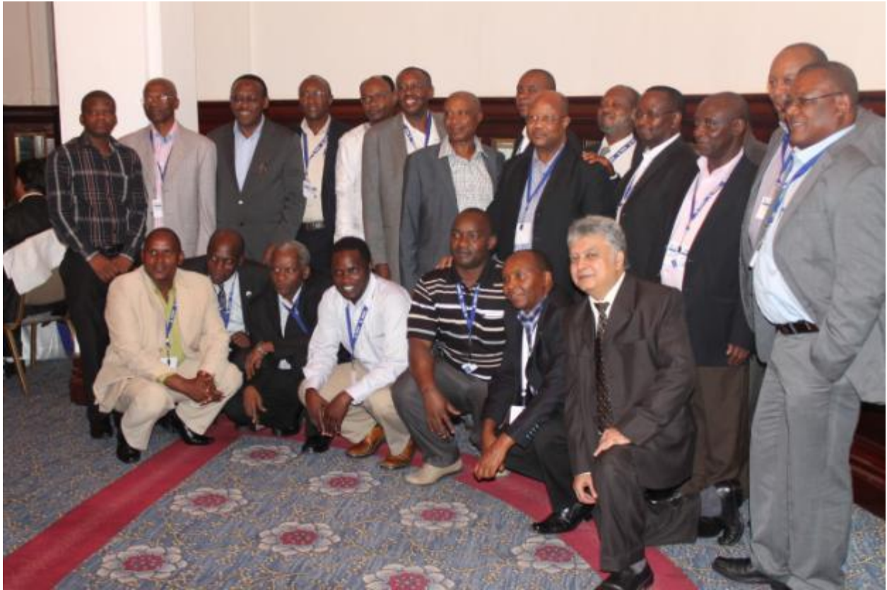
East African delegation to the GAMA conference held in Maputo Mozambique.