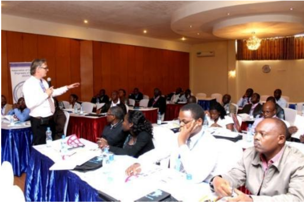
Participants at the recently held FIDIC Training at Pride Inn Hotel, 16 th to 19 th June, 2014.