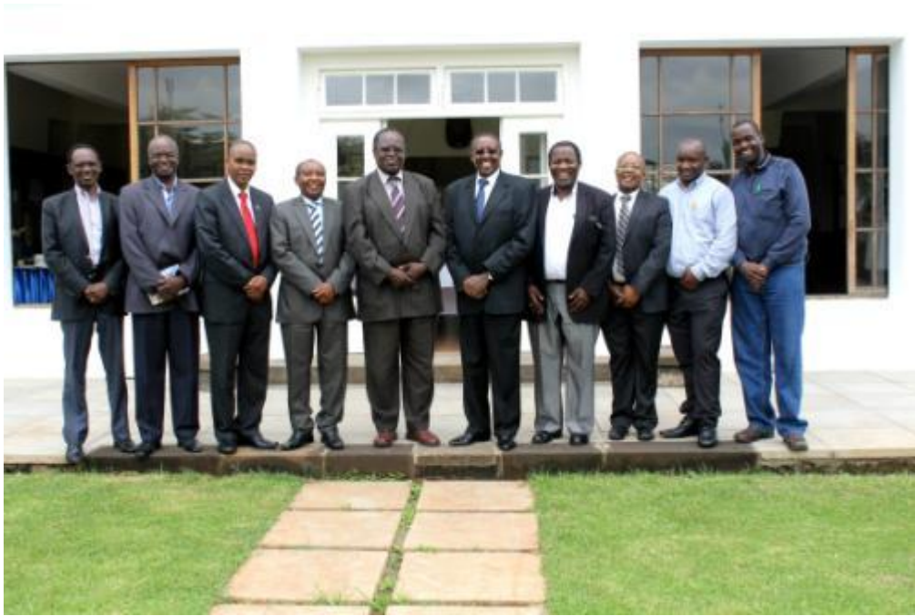
ACEK and IEK council members who attended the ACEK/IEK Luncheon in a group photo.